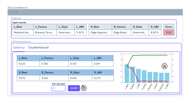
Figure 3: Debugging a DeepMatcher 's prediction with saliency explanations.

For the sake of clarity we prefix names of attributes coming from U and V with L_- and R_- respectively (e.g., L_- Beer corresponds to the Beer attribute from BeerAdvo datasource while R_- Beer corresponds to the Beer attribute from RateBeer datasource).