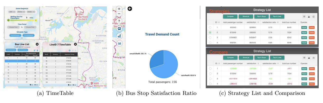
Figure 3: A Breakdown of the User Interface

by numbers from 1 to 5. Box 1 is a query panel where users could provide inputs for FASTS. Box 2 lists all the bus service routes, where users can select any route of interest to view the route on map and the bus schedule of that route. A user can zoom in or zoom out the map view to explore different levels of details by the button "+" or "-" in Box 3. The "?" button in Box 3 allows users to start a tutorial to learn how to use FASTS. Box 4 is a control panel where the four icons decide whether to show or hide bus lines, bus stop icons, the statistics reported, and the strategy list. Box 5 refers to the place where the statistics are visualized. Next, we will present the three main features of FASTS and five different scenarios where a user named Erin uses FASTS to schedule the buses.