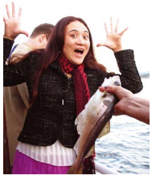
I'm the only one who got a fish, but I won't touch it!

Thirty-two participants enjoyed the fjord trip onboard Ulabrand. Shrimps and white wine were served in the beautiful weather. In spite of a combined fishing effort, no more than one small fish was caught.