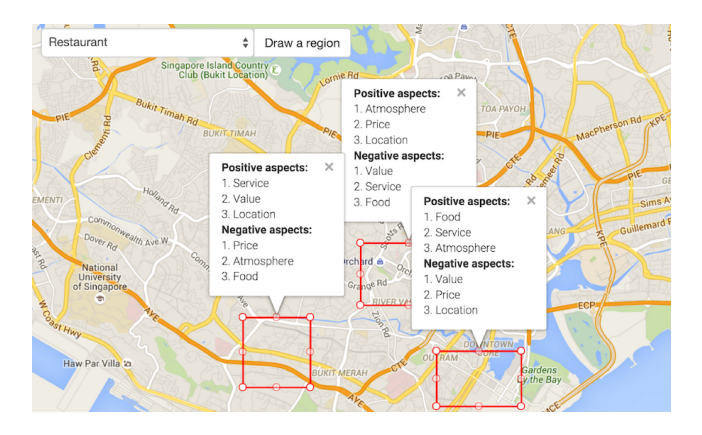
Figure 4: Aspect analysis in regions

Aspect analysis in a region : As shown in Figure 4, user can arbitrarily draw a region on the map and specify a category. PreMiner will return the most positive and negative aspects to the user.