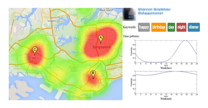
Figure 3: Temporal mobility patterns in personalized regions

Mobility & interests mining: When a user logs in, PreMiner will automatically retrieve her interests learnt by SAR/W4, For a new user without any historical data, PreMiner asks the user to sign up with Foursquare or Yelp account, or to specify some preferred POIs and keywords based on which it estimates the initial user interests. User's interests in topics (for Foursquare user), categories and aspects (for Yelp user) will be shown in the user's interests panel while personalized regions will be drawn on the map. Topics in W4 are expressed as a set of keywords while aspects in SAR are manually named according to the word distributions of the aspects. Foursquare user can explore the temporal mobility patterns and the keywords in the personalized regions (see Figure 3). When the user clicks on one of her mobility region, e.g., region B, the keywords shown in the right side of Figure 3 represent the user's activities and interests in the region, and the time patterns indicate the probability of the user staying in region B at different time.