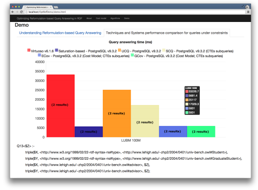
Figure 3: Demonstration screen shots.

evaluation costs, such as I/O, CPU etc.; in [5] we computed c based on database textbook formulas.