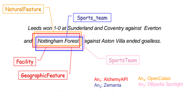
Figure 2: Conflicting and Re-enforcing Annotations

mantic annotations to lower the need for human supervision. On the other hand, annotation integration can also have an impact in terms of quality of the result. We will present experimental evidence (see Section 2) indicating that the most widely-used individual annotators suffer from serious accuracy deficiencies. The overlap in vocabularies from individual annotators could be exploited to allow an integrated annotator to boost accuracy by exploiting inter-annotator agreement and disagreement.