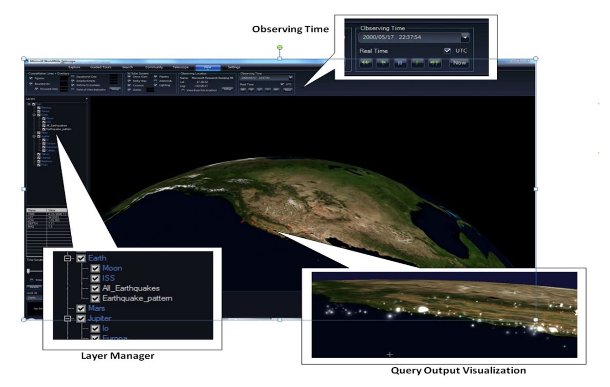
Figure 3. A screenshot of the WWT visualizing stream data.

The purpose of the custom-view preprocessing query is to inject filters and sampling operators in the query pipeline. The engine pushes these filters down the query plan to the input adapters to filter output tuples that consume processing resources and that produce output that is outside the user's visualization area. Similarly, as the user zooms out, the sampling rate is reduced to deliver good-enough images. As the user zooms in to a specific