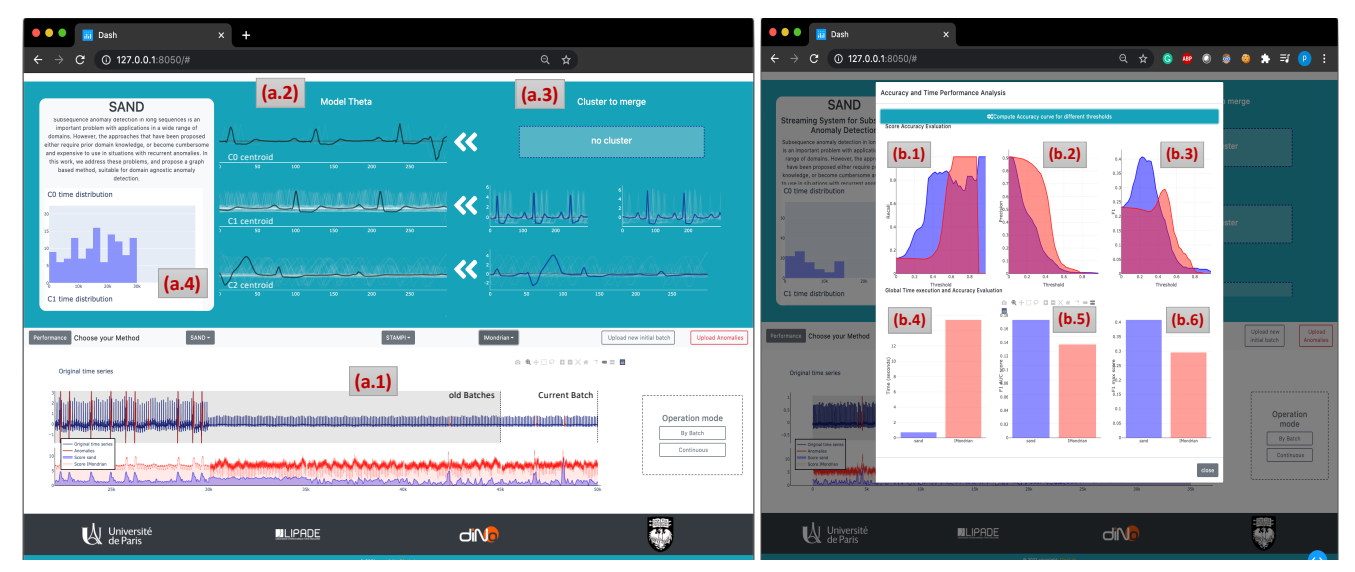
(a) Screenshot SAND system main frame

(b) Screenshot when performance button is pressed