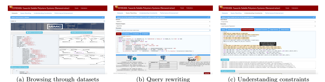
Figure 3: Screenshots of various ESTOCADA demonstration GUIs