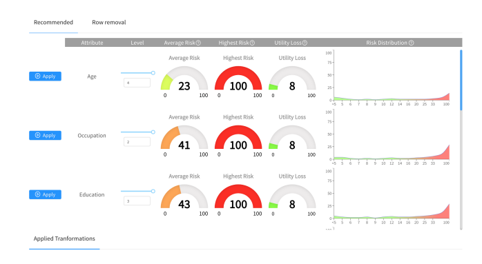
Figure 4: Attributes view (bottom-half of the dashboard, first tab). Ranked list of the attributes which contribute more to the overall reidentification risk. The system offer the possibility of generalizing them to different levels and seeing in real-time the effects that such data transformation has on the risk and on the utility of the data.

less trivial for categorical values, as in this case an attribute generalization hierarchy is normally based on the semantic meaning of the levels of the attributes. For example, countries could be generalized to geographical regions such as Europe. However, numerous ways of grouping the same elements often exist, and choosing the most appropriate one is not always straightforward and is often subjective. Given the complexity inherent to automatically creating hierarchies based on the semantic meaning, we derived a different approach. The idea used is akin to that of k-anonymity, namely to make the values indistinguishable from each other by grouping them in sets of values. The sets of the first level of the generalization hierarchy are created by grouping together the least and most frequent values of the attributes, then the second least and second most frequent values, and so forth. This logic is repeated for the following levels, with the values being replaced by the sets of the previous level, until the set containing all values is obtained. When there is an odd number of values, or sets, the least and second least frequent values are grouped with the most frequent one. This insures that the distribution of the sets in the data are fairly even.