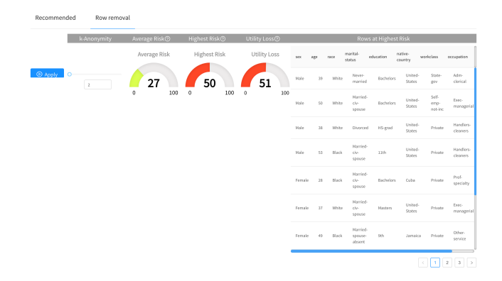
Figure 5: Rows view (bottom-half of the dashboard, second tab): shows the tuples that are at highest risk of reidentification and provides the possibility to suppress them.

In the attributes view, the user can experiment with the different recommended attribute generalizations. They can also try multiple levels of generalization for each attribute. The users will see in real-time the effects that any data transformations have on the reidentification risk and on the utility loss of the data.