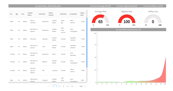
Figure 3: Table view (top-half of the dashboard). On the left-hand side a tabular overview of the data and on the right-hand side, the reidentification risk and utility loss panel.

Generalizing attributes is one of the main data-transformation operations towards achieving many different privacy policies. For this purpose, attribute generalization hierarchies are needed, and usually are requested to be provided by the user. In the spirit of limiting user-defined parameters and interventions, X^2\mathbb{R}^2 automatizes the generalization hierarchies creation. For numerical attributes this is straightforwardly achieved by creating a hierarchy of nested intervals, which are defined by taking in consideration the distribution of values and a predefined depth of the hierarchy. This is