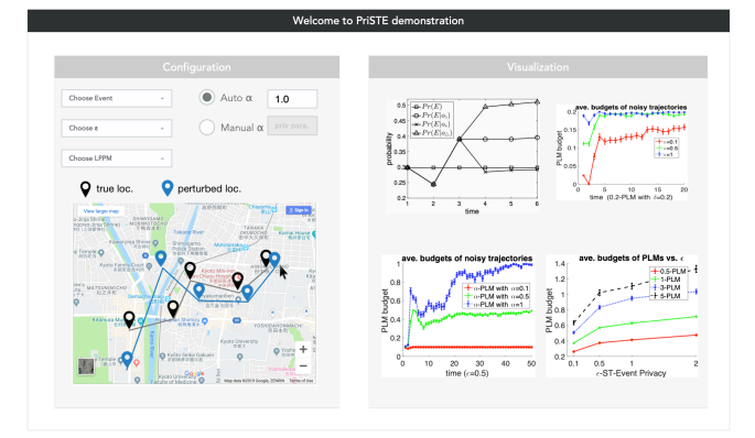
Figure 4: PriSTE Demonstration.

by LPPM. An intuitive and direct way to quantify the spatiotemporal event privacy is to calculate Equation (1) with given prior and observed perturbed (or true) locations. The attendee first configures the value of each input as shown in Fig. 4. Then, she or he can simulate a trajectory by clicking consecutive points on the map. Next, the information about how much adversary prior and posterior w.r.t. the user-specific spatiotemporal event will be plotted in the visualization panel in real time. The difference between prior and posterior indicates the loss of spatiotemporal event privacy. The attendee can observe that for some configurations (for example, recurrent events or a larger privacy parameter \alpha ), the spatiotemporal event privacy loss is quite high. It would be interesting to explore how these factors affect spatiotemporal event privacy loss.