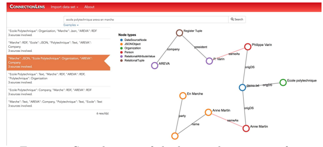
Figure 2: Sample view of the keyword query interface.