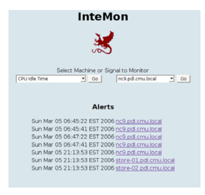
Figure 2: Data