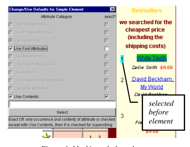
Figure 4: Marking a before element