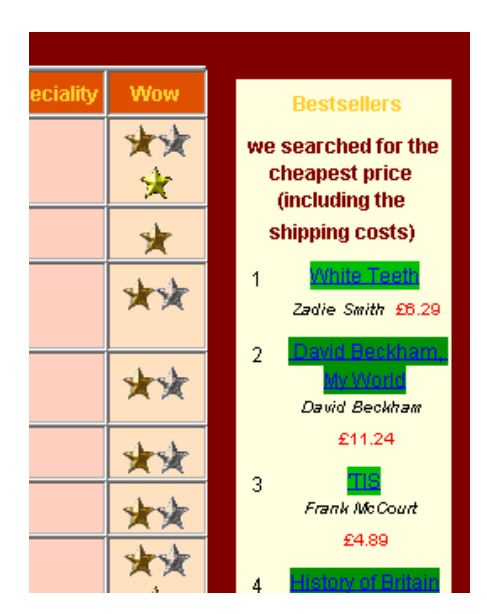
Figure 2: Testing a filter