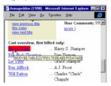
Figure 2: the extraction wizard.

For a given HTML document, the wizard feeds it into W4F and returns the document to the user with some invisible annotations (the document appears exactly as the original).